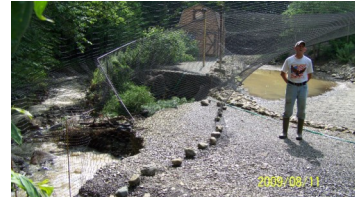
Milt Miner with the flood damage

ter reconstructed our aviary. They worked for 3 weeks with a skid-steer and excavator and 230 ton of stone. Gernatt and County Line Stone gave us a reduced price on the stone and hauling. Creative Fence repaired our fence at very little cost. Our Lower aviary is now built with 3 backup dams and spillways which take any excess water away from the banks. We re-opened our Lower Aviary to the birds on September 20 with a fundraiser, live country music and a Chinese and silent auction. We added 50 birds and 7 new species to our flock to replace the birds that we lost. We also added mail order brides for the species that lost their females.