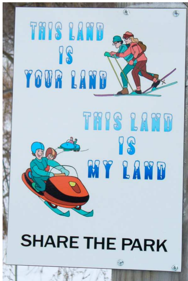
New Sign At Harriet Hollister 12/2009